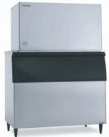
KM-1301 / KM-1601