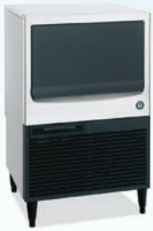
KM-101 / 151

The AM Cuber features a stainless steel finish and fewer moving parts for longer life. The AM-50 is available with swing style field reversible door, fits conveniently into standard cabinetry and is UL approved for outdoor use. The AM-50BAE-AD is ADA approved height.