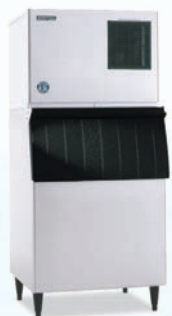
KML-250 / 351